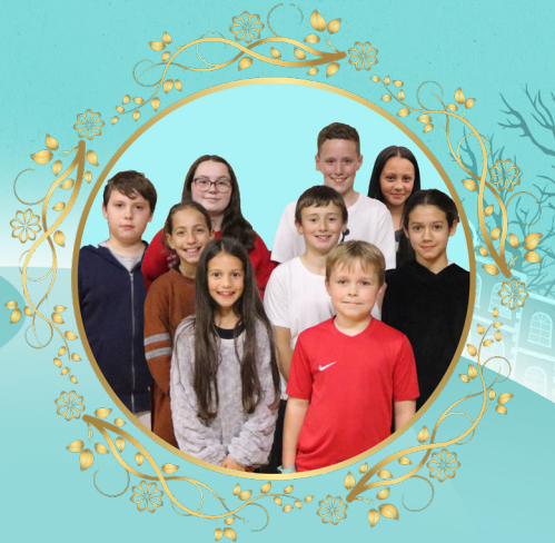
JUNIOR WILD WOODERS